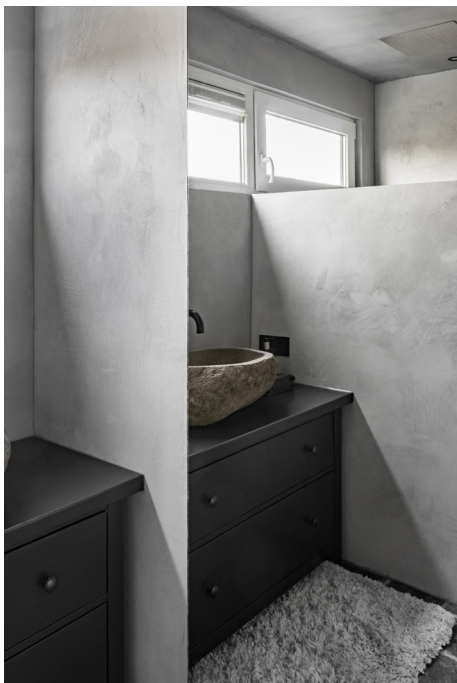
f.l.t.r. WALLS Fresco White Rhino WINDOW FRAMES Traditional Paint Cannonball STAIRS Carazzo Cannonball WALL BATHROOM Marrakech Walls White Rhino met Dead Flat Eco Sealer CABINET Traditional Paint Cannonball