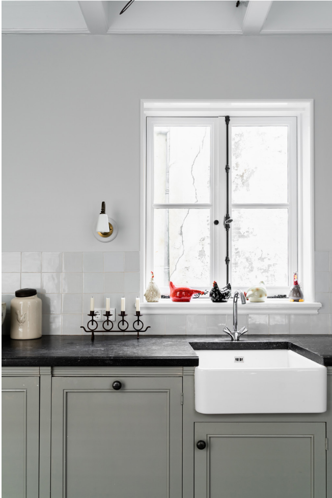
CEILING Traditional Paint Silk White WALLS Licetto Ashes CABINETS Traditional Paint Evening Shadow WINDOW FRAMES AND DOOR Traditional Paint Silk White

"We were looking for wall paint that is both practical and beautiful at the same time."