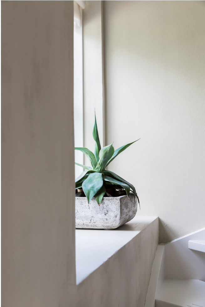
WALLS Fresco Urban Putty STAIRS Carazzo White ▷ WALLS Fresco Old Romance CEILING Classico White WINDOW FRAME Traditonal Paint White