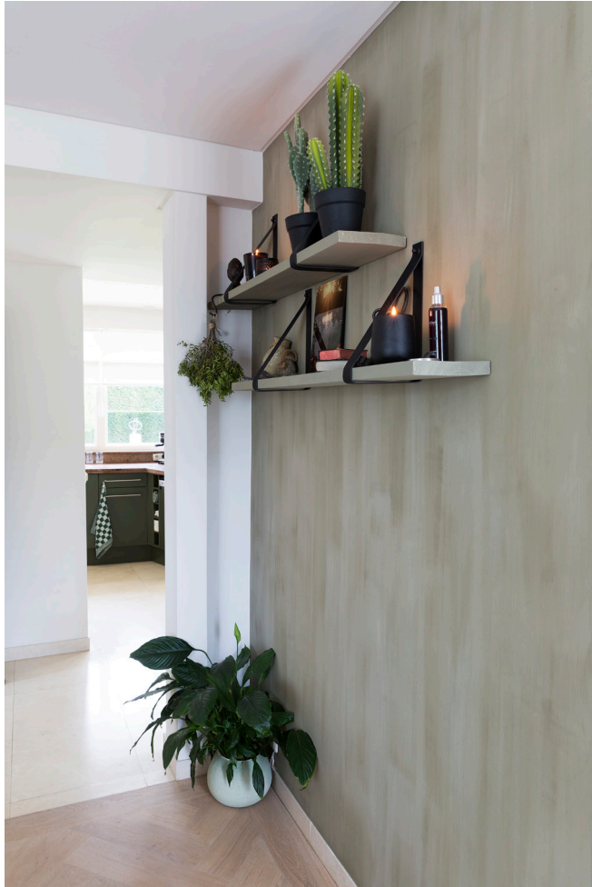
CEILING Classico Ashes WALLS LIGHT Classico Ashes WALLS GREEN Fresco Belgian Wilderness KITCHEN Traditional Paint Belgian Wilderness