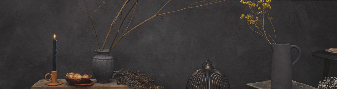
f.l.t.r. Old Romance, Polar Blue, Bohemian Vintage