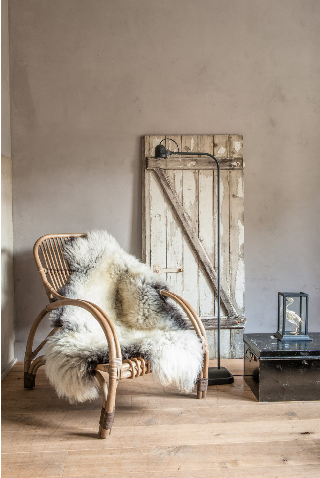
WALL Fresco Old Romance ▷ WALL Fresco Old Romance