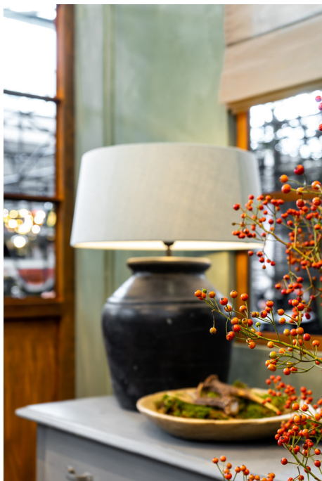
◁ WALL BLUE Fresco Blue Reef FRAME Traditional Paint Cannonball WALL GREY Fresco Wet Sand Δ f.i.l.r. WALLS BATHROOM Licetto Moonstone WALLS LIVING ROOM Fresco Moonstone CHEST OF DRAWERS Classico Earth Stone CABINET Traditional Paint Moonstone