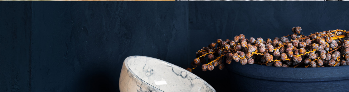
f.l.t.r. Tin Kettle, Tundra, Ink Blue