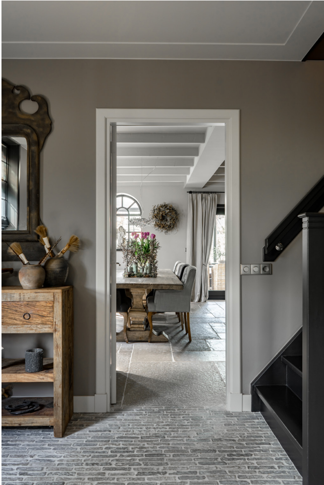
WALLS HALL Classico Wet Sand CEILING Classico Warm White STAIRS Carazzo Black Truffle WOODWORK Traditional Paint White WALLS DINING ROOM Licetto Old Flax